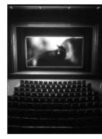
The Paradise Institute, Power Plant