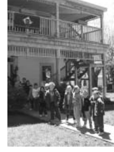
Doors Open Ontario, Ontario Heritage Foundation

In order to minimize the demands placed on applicants' staff and volunteers, OCAF has taken care to clearly communicate the Fund's purposes and to design an efficient approval process. There is a two-stage application process for OCAF investment. At Stage 1, the eligibility of organizations is determined through a straightforward two-page form. Only eligible groups move on to the more detailed Stage 2 application. The OCAF Board of Directors makes funding decisions regarding Stage 2 applications with the advice and assistance of OCAF staff. To date, a large proportion of organizations invited to submit a Stage 2 application are approved for funding. These clients generally receive a large portion of the amount that they request. OCAF has received high quality applications and has been committed to fully fund projects that have a good prospect of success.