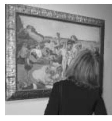
Voyage into Myth, Art Gallery of Ontario