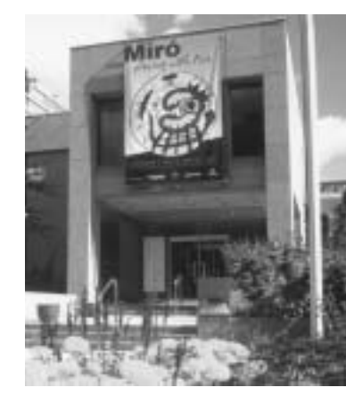
Miro: Playing with Fire, Gardiner Museum of Ceramic Art

In order to help our clients attract even more visitors, OCAF has designed a self-help marketing resource workbook, Plan to Succeed , which guides cultural organizations through the steps involved in researching and planning a successful event. The workbook is designed to help cultural organizations increase their effectiveness in reaching potential audiences. The workbook can be a valuable resource for any cultural organization, not just OCAF clients. In addition to the workbook, OCAF staff has provided consultation and other support as requested by clients.